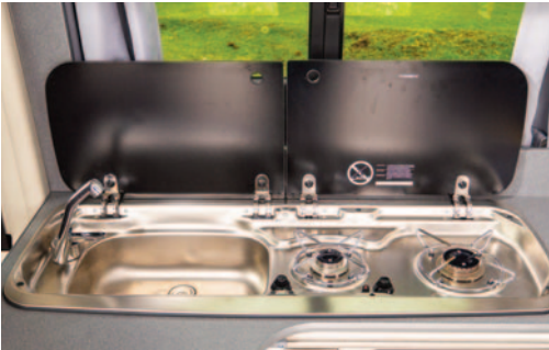
Dometic combined gas hob with sink