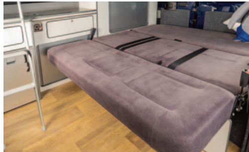
Full sized double bed