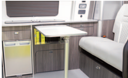
Fold away table