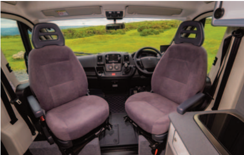
Swivelling front seats