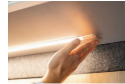
Touch sensitive LED lighting