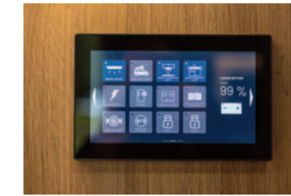
Touchscreen control panel