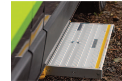
Automated side step